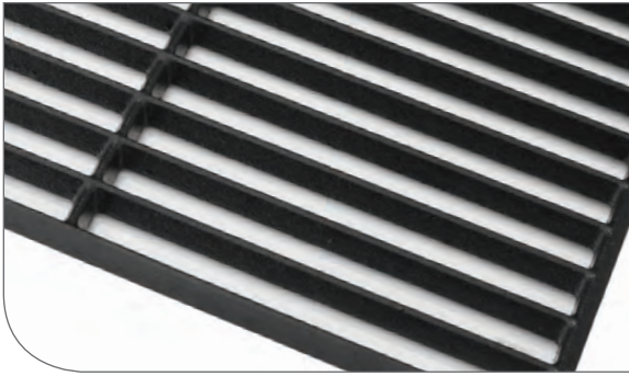
CAST IRON GRIDS