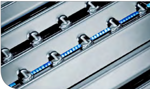
STAINLESS STEEL FLAV-R-WAVES™