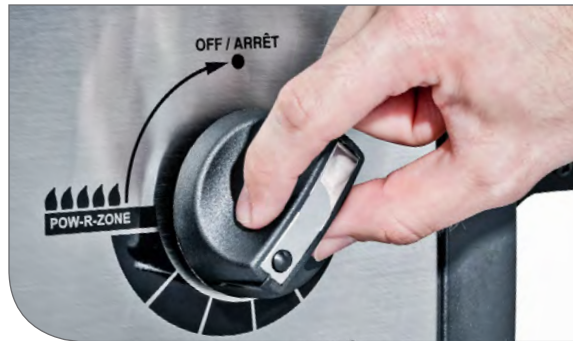
SENSI-TOUCH™ CONTROL KNOBS