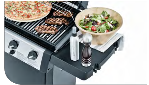
DURABLE RESIN SIDE SHELVES